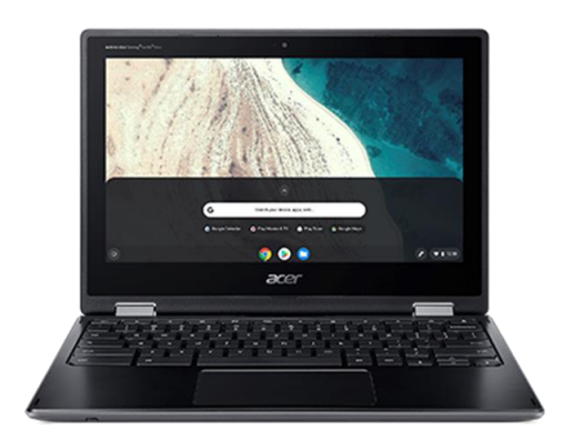
Acer R756TN Chromebook $613.60