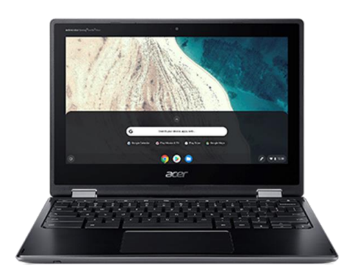
Acer R756TN Chromebook $613.60