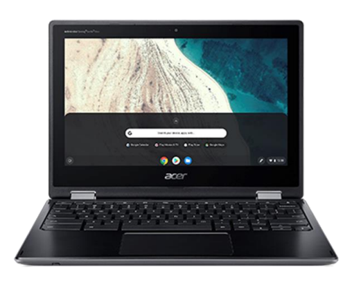
Acer R756TN Chromebook $613.60