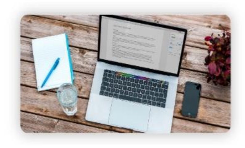
Support the Development of Digital Literacy

The use of the PLD for teaching and learning aims to: